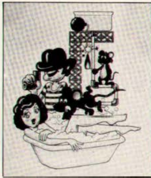
FriskyTom, an arcade game from Nichibutsu, bordered on the risqué.